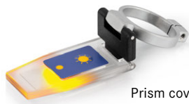
Prism coverplate with LED ORA-A1101