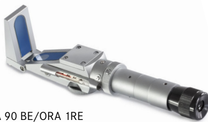
ORA 90 BE/ORA 1RE