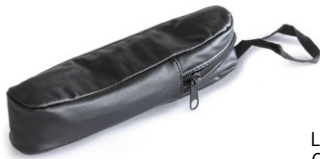
Leather bag ORA-A2103