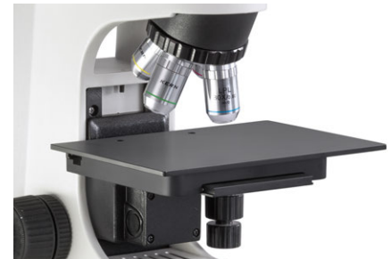
Stage and objectives