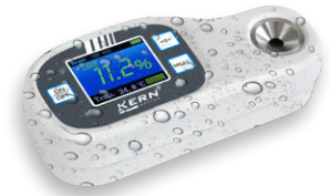
IP65: Protected against dust and water splashes