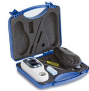
Transport and storage case