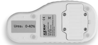
Rear view, screw-on battery compartment cover