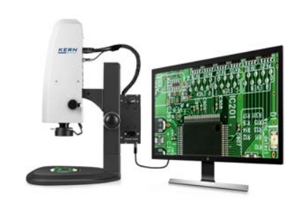
Side view with screen connected (not included with delivery)