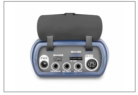
...and data transfer using MicroSD (4G) memory card (included in delivery), RS-232 or USB